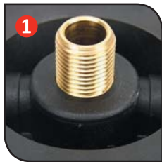
Reinforced brass thread insert